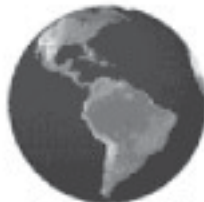
Sphere with texture