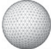
Sphere with no texture